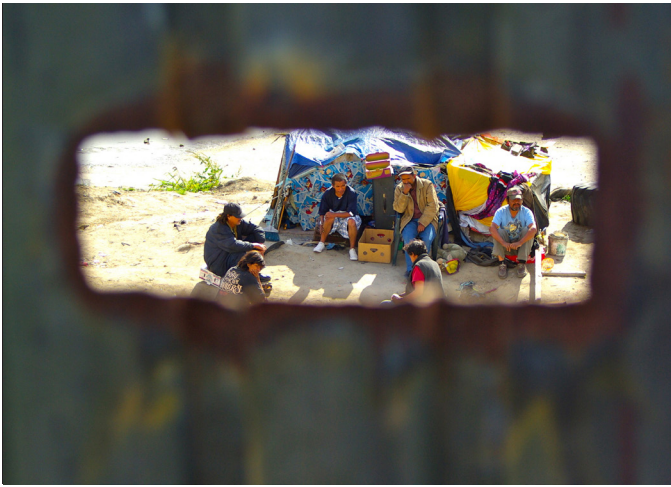
Figure 2: View of ñongos

being a border town into a modern city; the project involved large parcel lots and grand buildings for public administration, culture, commerce, and housing. However, the vision of Tijuana's bright economic future mirrored by urban planning has continued to be challenged by the realities of this contested territory.