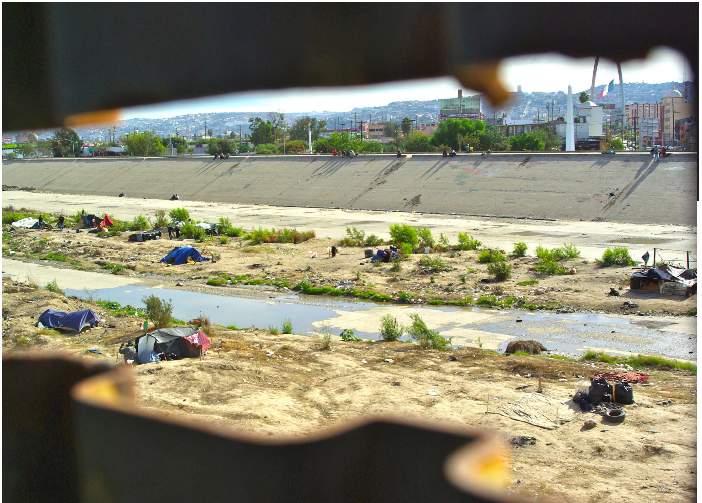
Figure 1: View of fiongos

for habitation along the river started to drastically change in the late nineteen forties with the construction of the bridge, Puente México, that spanned over the river and connected the border crossing with the city center. Construction workers and their families built a large irregular settlement near the job site inside the unregulated riverbank. Government quickly took strong action, displacing the illegal 300 homes to new colonias in the southeast periphery of the city. To further prevent the growth of illegal settlements, public recreational projects were built on sites that were likely to attract this type of development. Nonetheless, illegal construction persisted. More than 1,500 people illegally appropriated the watershed through the 1950's and the government continued to look for new areas to displace them. By 1955 all homes at the river watershed had been entirely removed(3).